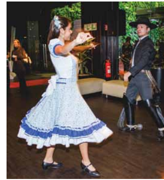
Monday Night Exhibitor Open House Reception Entertainment from Chilean Dance Troop