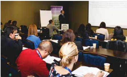
ISPOR Short Course "Meta-Analysis & Systematic Literature Review"

"The themes addressed in the plenary sessions were comprehensive and relevant, with great quality of the presentations and good discussions. Some of the panels also stood out by the timeliness of the themes." – ISPOR 5th Latin America Conference Attendee (Source: Online Conference Evaluation)