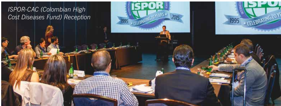
ISPOR-CAC (Colombian High Cost Diseases Fund) Reception