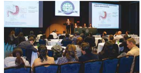
Is Advanced Gastric Cancer Treated In Latin America? How Can We Reduce the Burden of the Disease? ISPOR 5th Latin America Conference Symposium