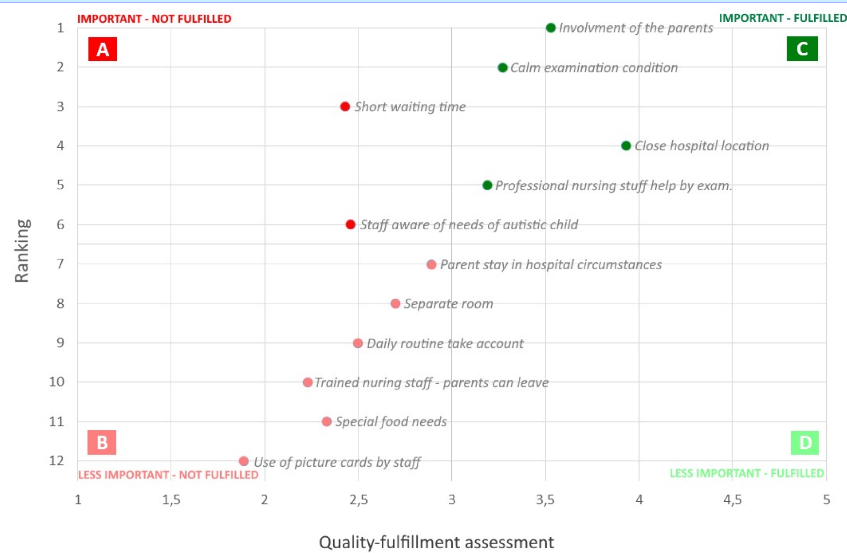
Figure 3. Ranking and quality assessment of hospital care factors of autistic children according to the parents responses (n= 70)