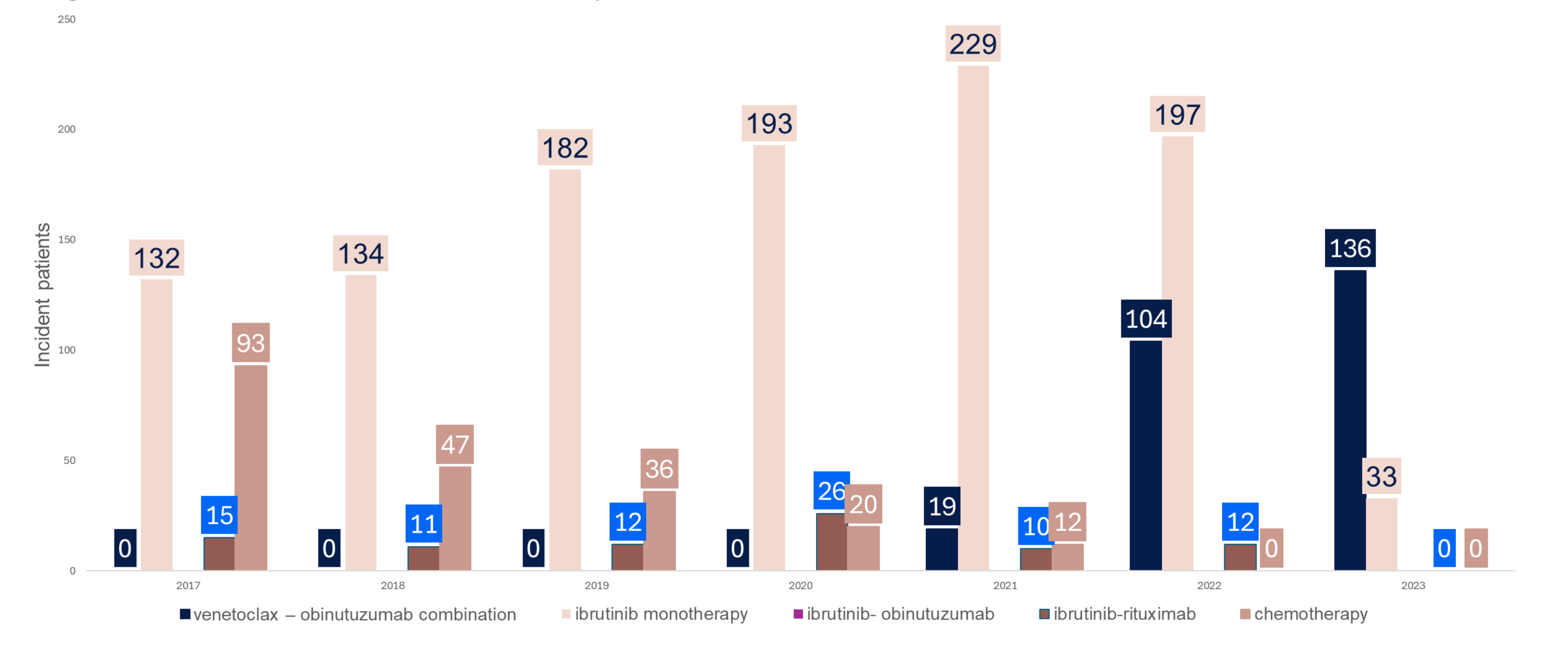
Figure 1 illustrates the unadjusted incident patient number by mono and combination therapies among patients with CLL. During the research period, there have been notable shifts in the landscape of 1L CLL treatment. The predominant trends can be summarized as follows:

Figure1: Incident patient number by mono- and combination 1L CLL therapies