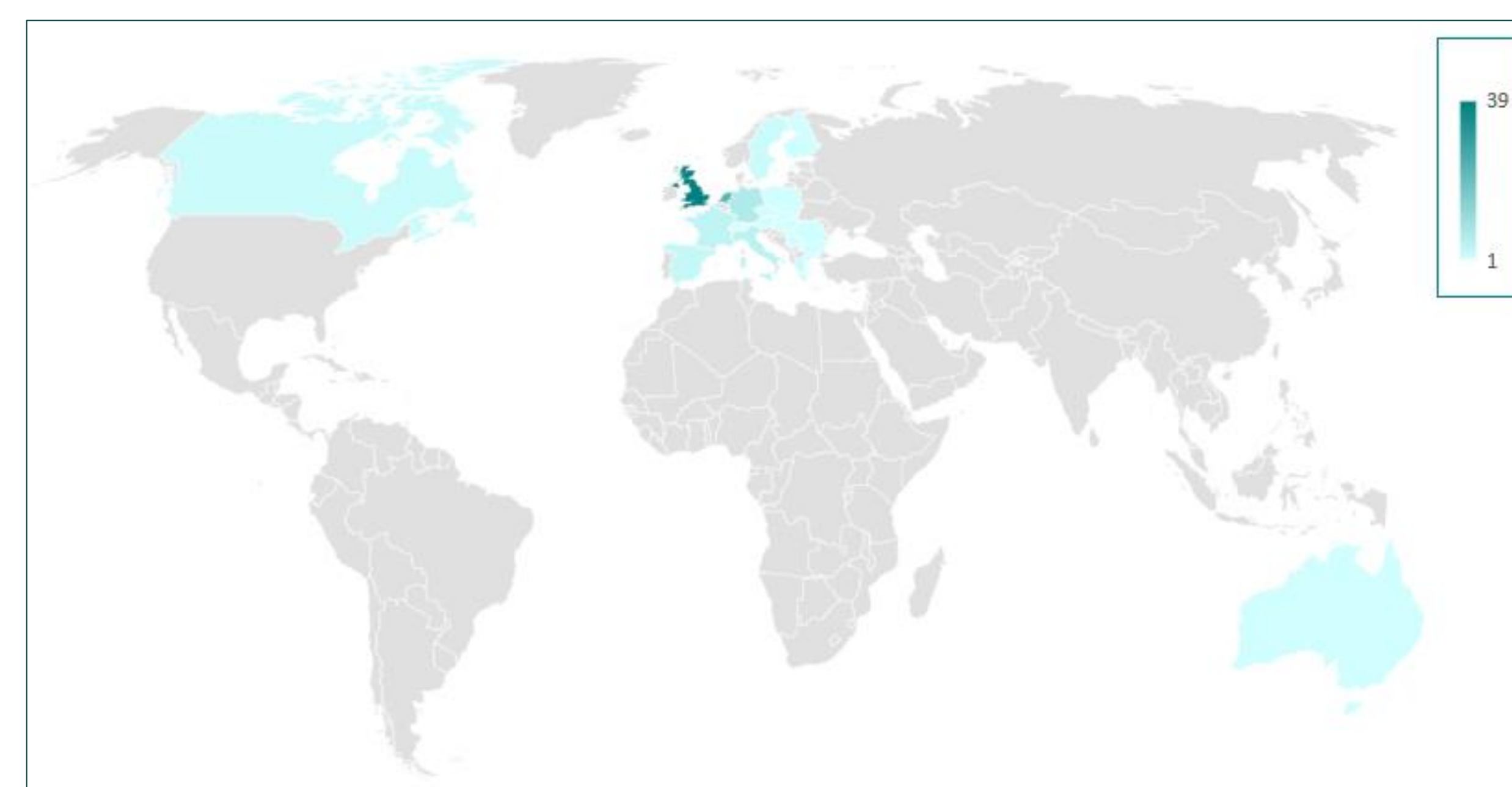
Figure 2: Number of publications by jurisdiction