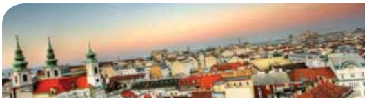
EXHIBIT PROGRAM OVERVIEW