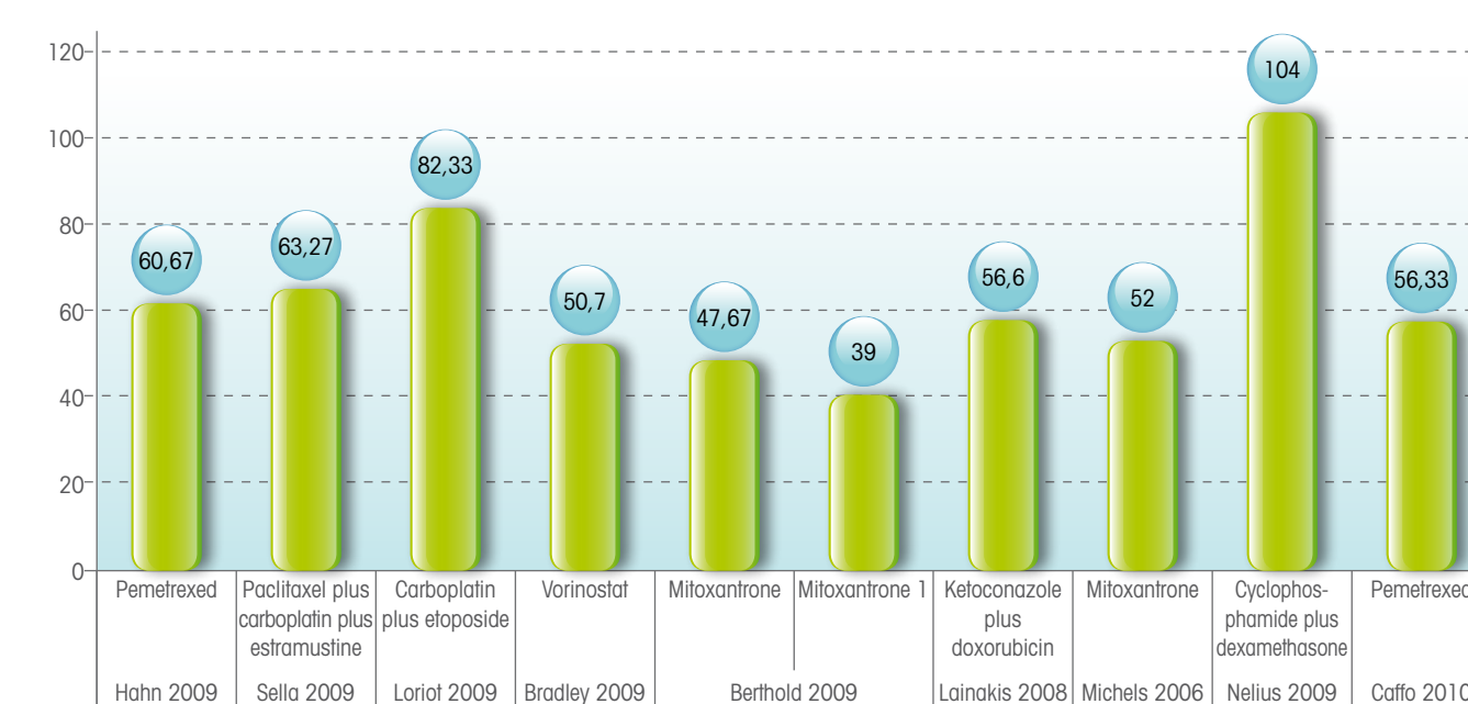
Table 2 • Mitoxantrone and others regimen based trials