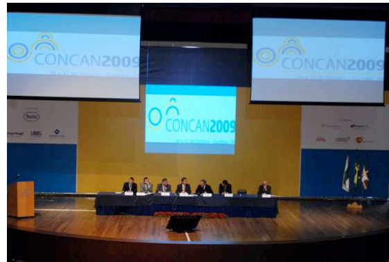
COCAN 2009, Curitiba, October 2009