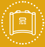
Exhibit & Event Sponsorships

ISPOR hosts the leading global scientific and educational conferences in the field of health economics and outcomes research (HEOR). ISPOR conferences are attended by thousands of leaders and experts representing all facets of healthcare, including researchers and academicians, regulators and assessors, decision makers, clinicians, industry, and patient representatives.