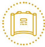
Exhibit and Conference Sponsorships

Progress through partnerships— improving healthcare decisions together.